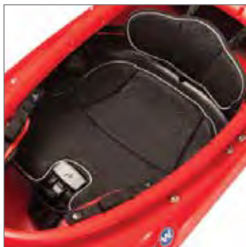
PHASE 3® AIRPRO XP