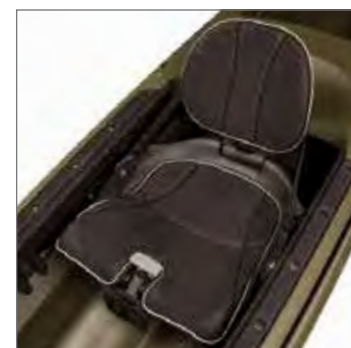
AIRPRO FREEDOM ELITE: RIDE/COMMANDER