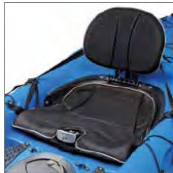
PHASE 3® AIRPRO SOT