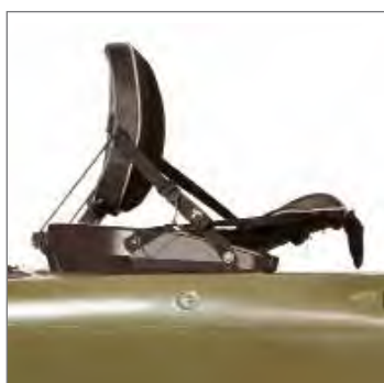
PHASE 3® AIRPRO ADVANCE