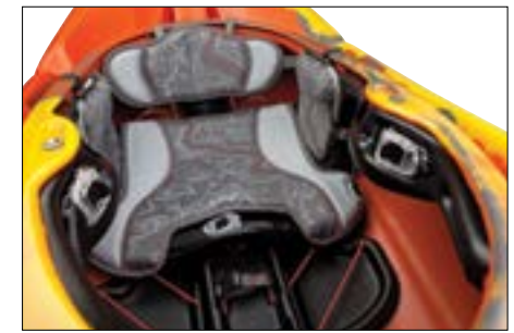
CONTOUR ERGO - CREEK VERSION