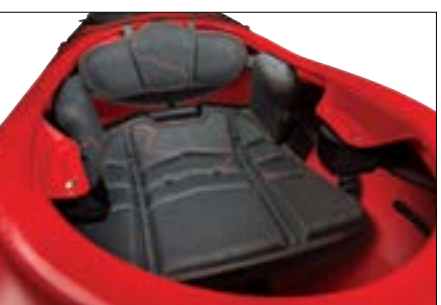
COMFORT FIT SYSTEM