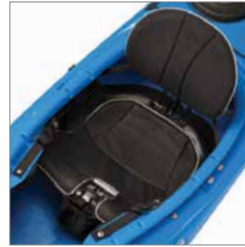
PHASE 3° AIRPRO TOUR