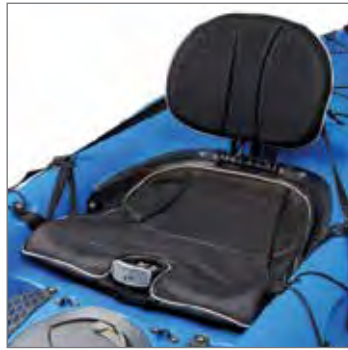
PHASE 3° AIRPRO SOT