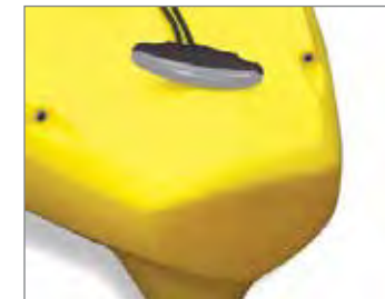
RUDDER READY MODELS

Many models ship "rudder ready" with internal tubing that houses rudder cables pre-installed for simple, rapid addition of after-market rudder kits.