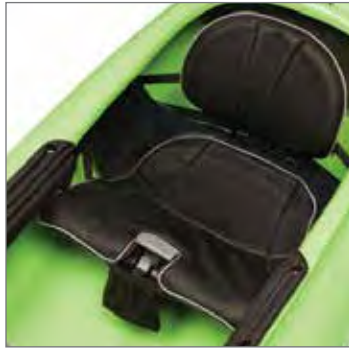
PHASE 3° AIRPRO