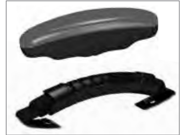
SOFT TOUCH & COMFORT CARRY

Ergonomic handles conform to the hand shape. Handle construction materials deliver a secure and comfortable grip. Loading, unloading, and carrying a kayak is easier than ever.