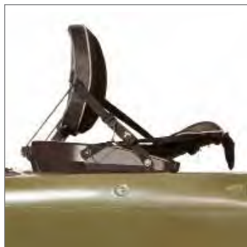
PHASE 3° AIRPRO ADVANCE