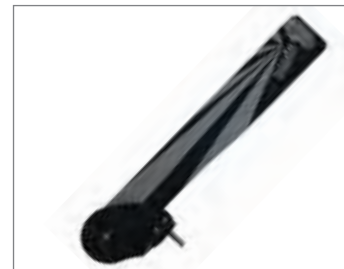
BLADE TRACKING SYSTEM

Take control and gain paddling efficiency in windy and choppy conditions or in fast current. Rudder kayak models come with the BTS Rudder kit pre-installed.