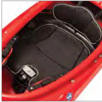
PHASE 3° AIRPRO XP