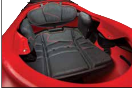
COMFORT FIT SYSTEM