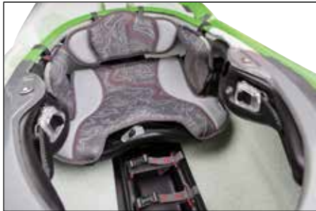
CONTOUR ERGO - PLAY VERSION