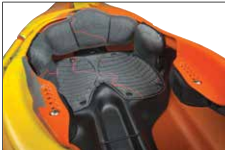
PERFORMANCE FIT SYSTEM (PFS) 2.0