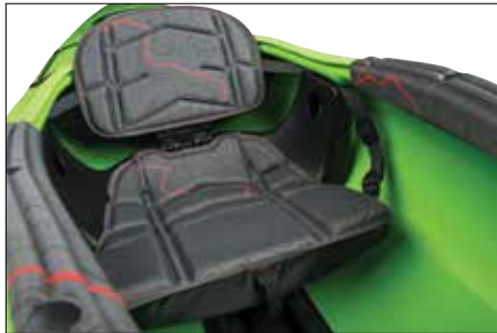
COMFORT FIT SYSTEM - RECREATION