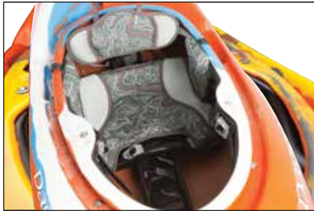
CONTOUR ERGO - CREEK VERSION